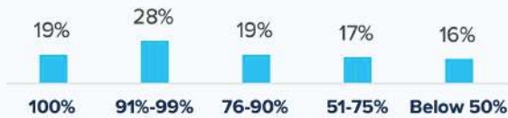
Chart 1. ULBs in Percentage by coverage range